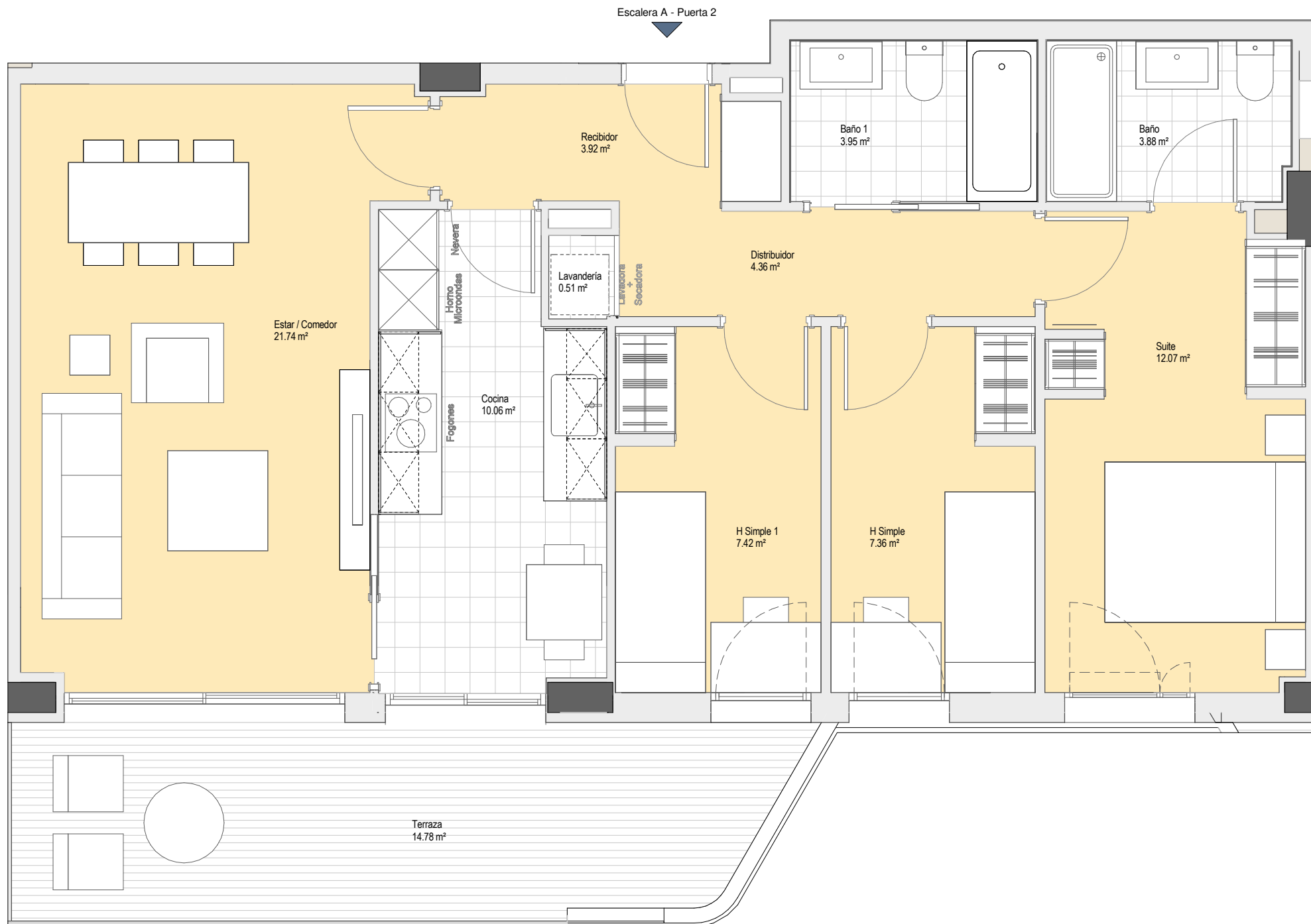
Vivienda Tipo 3D02 1:50 (A3)